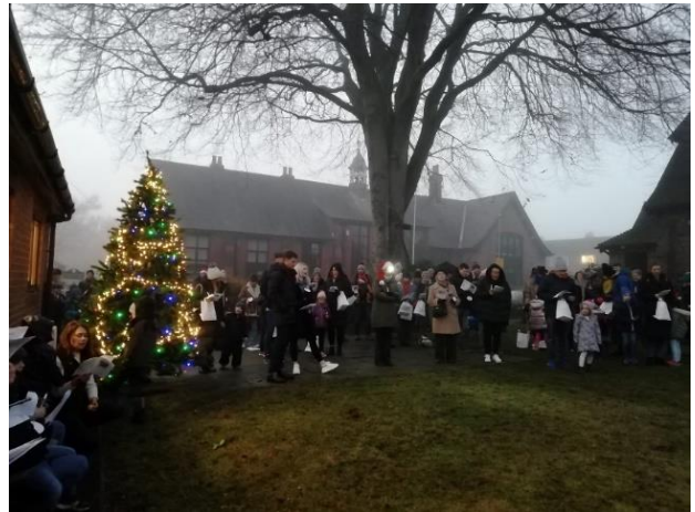
St Anne's Christingle Service

We have held special services for the following occasions:-