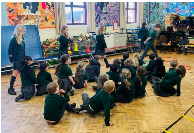
In the Hall