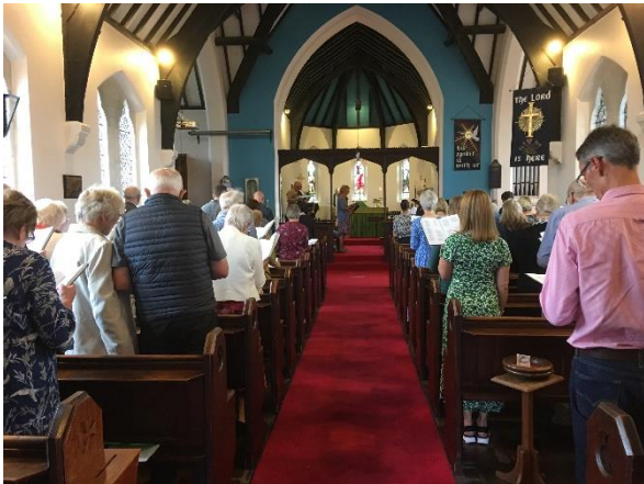
Combined Service at St Anne's

In St Anne's the Order of Service has remained constant and identical to that used in St Bart's. The Parish Orders of Service, used for all Communion, were introduced by the Rector before last and have remained in use. In both Churches the first (usually New Testament) Reading and the intercessions are led by members of the congregation.