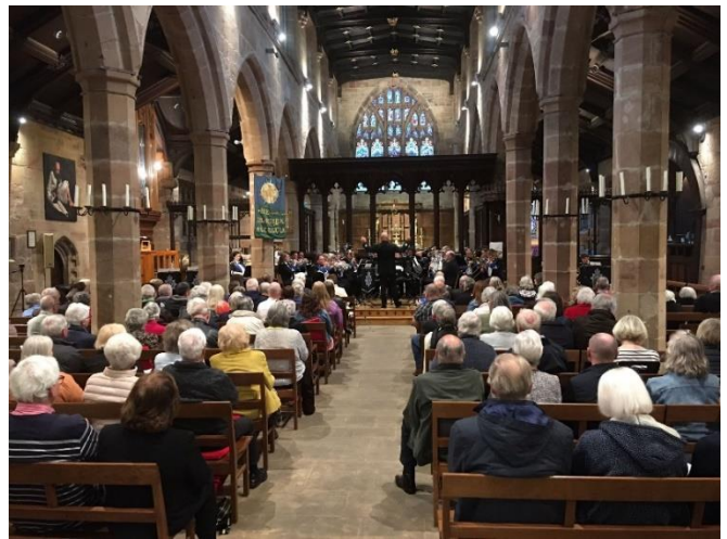
Band Concert in St Bart's

St Bart's has a new three-manual York Pipe Organ (2018) plus a grand piano for use by the church and community. St Anne's has a two-manual Allen electronic organ. Both churches have a media projector and screen with a professional sound system ideal for presentations and concerts.