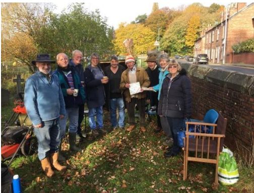
The Gardening Team

We have many volunteers who give generously of their time to help with all aspects of church life from cleaning and laundry, setting up for services, bell-ringing, opening up church buildings, gardening, running and hosting home groups and, of course, baking! However we are always keen to attract new volunteers, both to help with the necessary tasks and to expand the reach of the Church in the community.