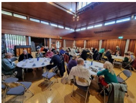
Neighbourhood Network tea-party

Our Neighbourhood Network is a group of church members who befriend and support parishioners, as well as welcoming new people in the congregations. They are a link between members of the church and the clergy when required. The Neighbourhood Network team maintain personal links with their group of parishioners. They keep in touch by the sending of Church Easter and Christmas cards, and the team holds two social gatherings each year for everyone.