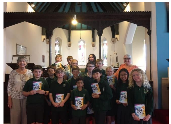
St Anne's School, Year 6 Presentation