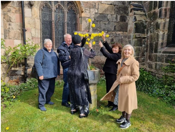
Easter daffodils at St Bart's

As is traditional we aim to enhance the normal pattern of worship at Easter and Christmas, and other Festivals such as Harvest and Remembrance Day.