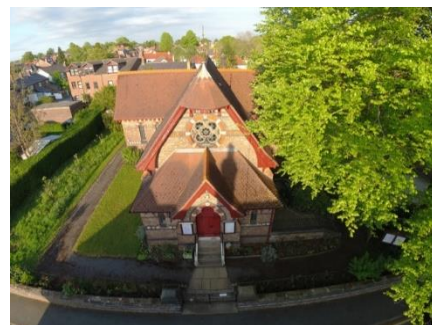
St Anne's from the air

St Anne's was originally built in 1876 to house both Church and school. It includes a vestry with a sink and cupboards as well as the priest's vestry. It is in a good state of repair following an excellent Quinquennial in June 2021.