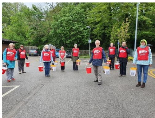
Collecting for Christian Aid