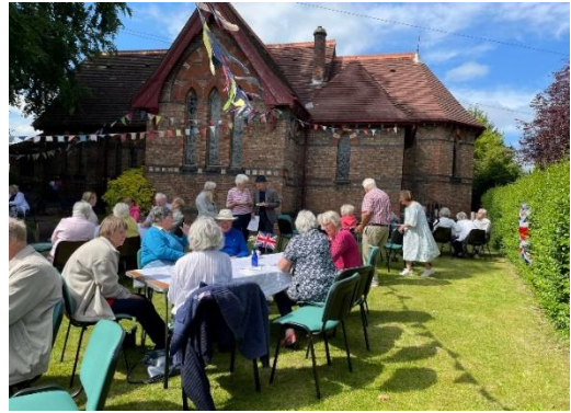
Jubilee Tea Party in St Anne's Hall gardens