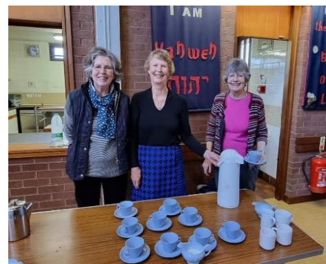
....and in the Parish Hall