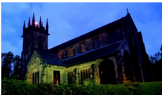
St Bart's with Jubilee Beacon

The building is in a good state of repair with no major work currently needed. The tower houses 6 bells, which are rung by our dedicated team of ringers every week and also for weddings and on special occasions.