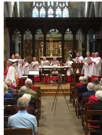
Evensong at St Barts

The Parish has a full set of vestments in both Churches which were previously in use every Sunday, though this practice has lapsed. There are no longer any Servers involved in our communion Services.