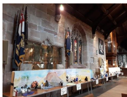
Knitted Bible Exhibition