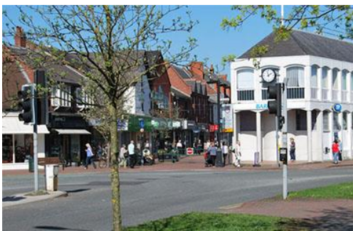
Centre of Wilmslow

The Parish has a population of around 18,413 split largely between families with young children/teenagers and retired people. It is an affluent, predominantly professional white middle class area. The Parish also includes some social housing.