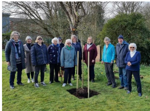
Planting the Jubilee Tree at St Bart's