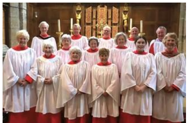
St Bart's Choir