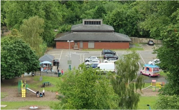
Parish Hall viewed from St Bart's tower

The St Anne's Hall is adjacent to the church, with good toilet and kitchen facilities. It is also used for church activities, and is hired out for community use.