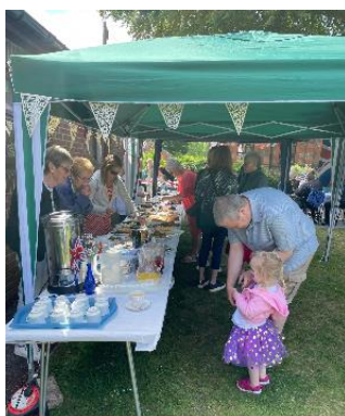
Tea Party at St Anne's