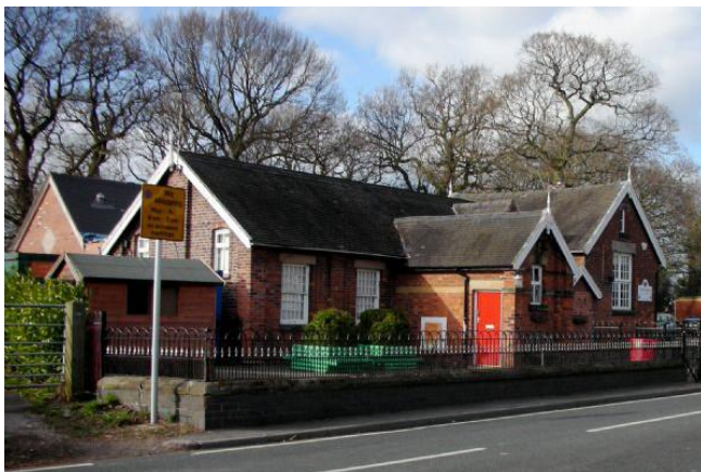
Top: 'Blessing the plough' 2019. Right: Remembrance Window Left Warmingham Wakes Refreshment tent volunteers Bottom left: Warmingham Primary School