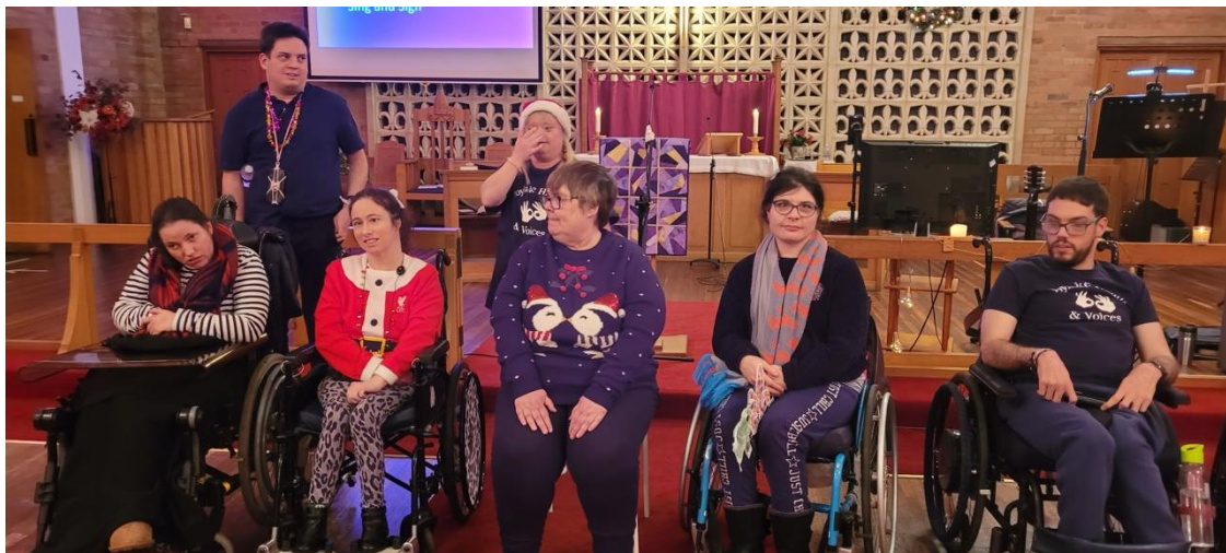
Sing and Sign contributed to the Carol Service 2023