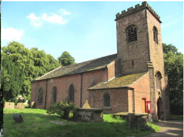
St. Mary the Virgin, Bosley