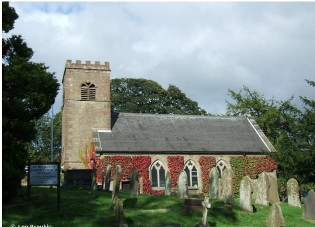
St. Michael, Wincle