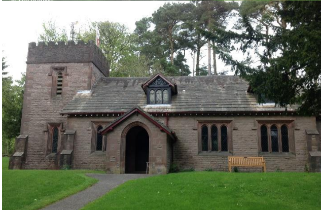
St. Saviour, Wildboarclough