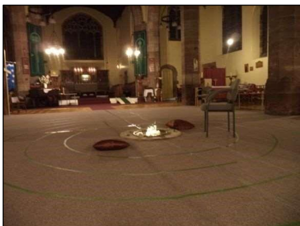
our prayer Labyrinth

St Peter's is a traditional Anglican church, celebrating Holy Communion every Sunday morning and using Common Worship with a traditional repertoire of hymns – we also hold a joint sung Evensong service once every two months. Although we have no permanent organist now, we have a church organ which we would like to see used more regularly.