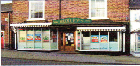
Huxley's Country Store 13, High Street, Malpas, Cheshire 01948 860352

The bakery serves homemade products such as pies, pasties, breads, cakes and sandwiches. They also sell fresh vegetables, cooked meats (including spit-roast chickens), cheeses and general groceries and wines & spirits.