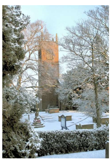
St Luke's in Winter

Village sports facilities and several uniformed organisations exist locally, making Goostrey a great place for young families. A new scout hut has been built with funds mainly being raised within the village. The village sports ground, with multi sporting facilities, was also funded by the village. More information on the village can be found on www.goostreyparishcouncil.gov.uk