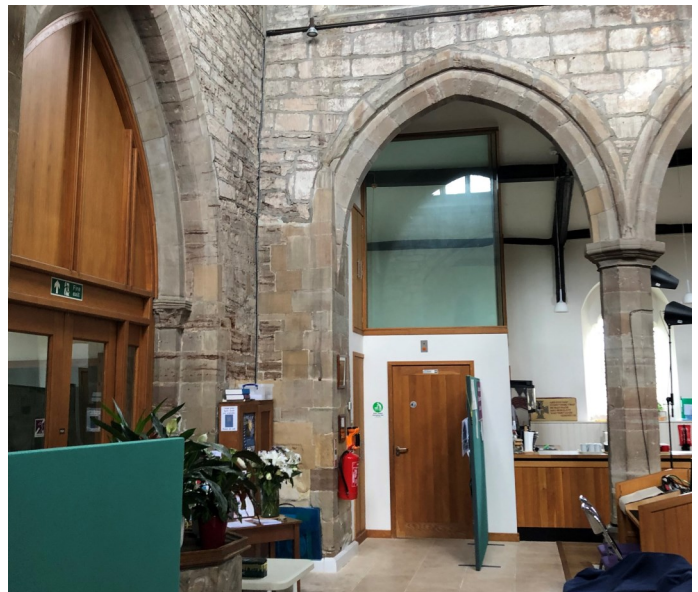
Below: Gotham, St Lawrence (Southwell & Nottingham), the accessible toilet and plans for the new entrance area.

Permission in a faculty is needed for works that will make a change to the building. The need to go through the process can be beneficial for the church and improve the proposals. Gaining a faculty requires consultation within the diocese with your Diocesan Advisory Committee (DAC). Many DACs will have an access adviser who should be of particular help to you. If the church is a listed building you may also have to consult with Historic England and amenity societies, such as the Victorian Society or the SPAB. The Church Buildings Council may also be a consultee for some proposals.