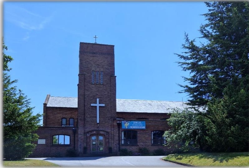
ST THOMAS & ALL SAINTS

CHRIST IN THE CENTRE OF THE CHURCH; THE CHURCH AT THE CENTRE OF THE COMMUNITY.