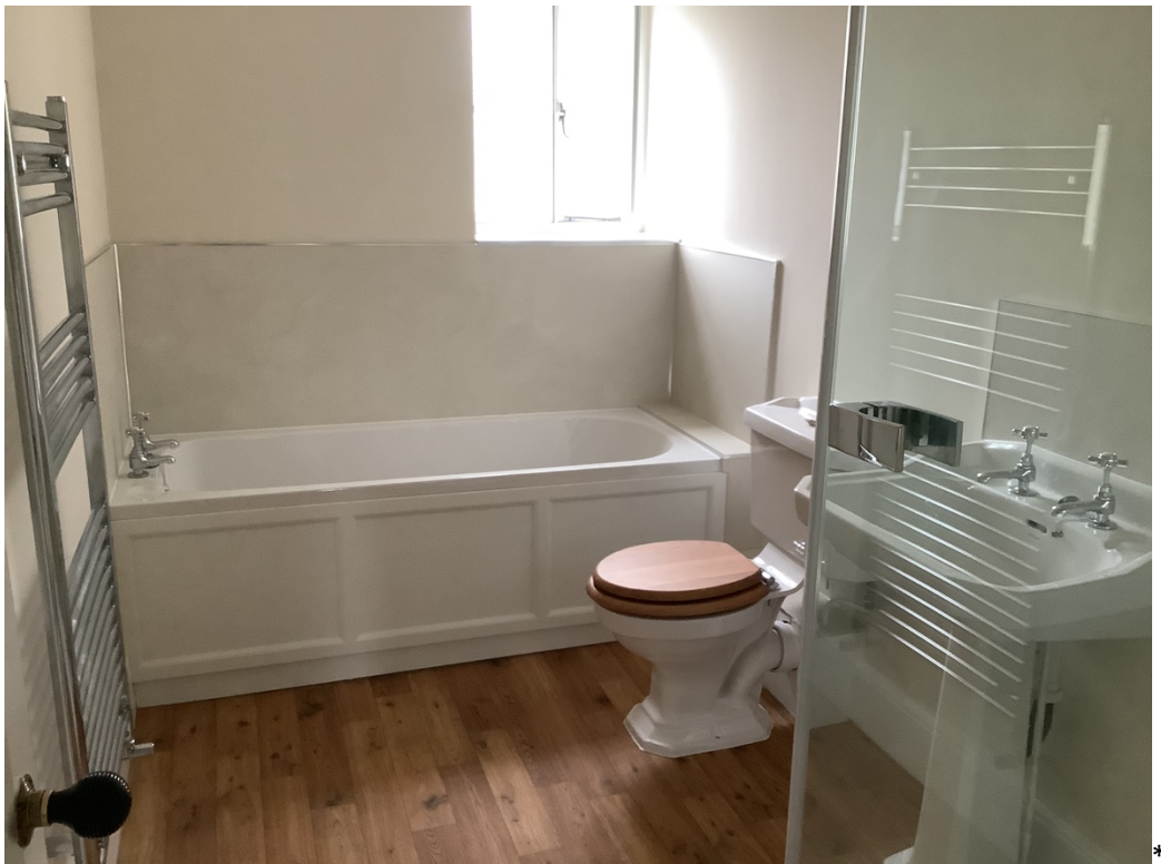
Figure 11 Bathroom