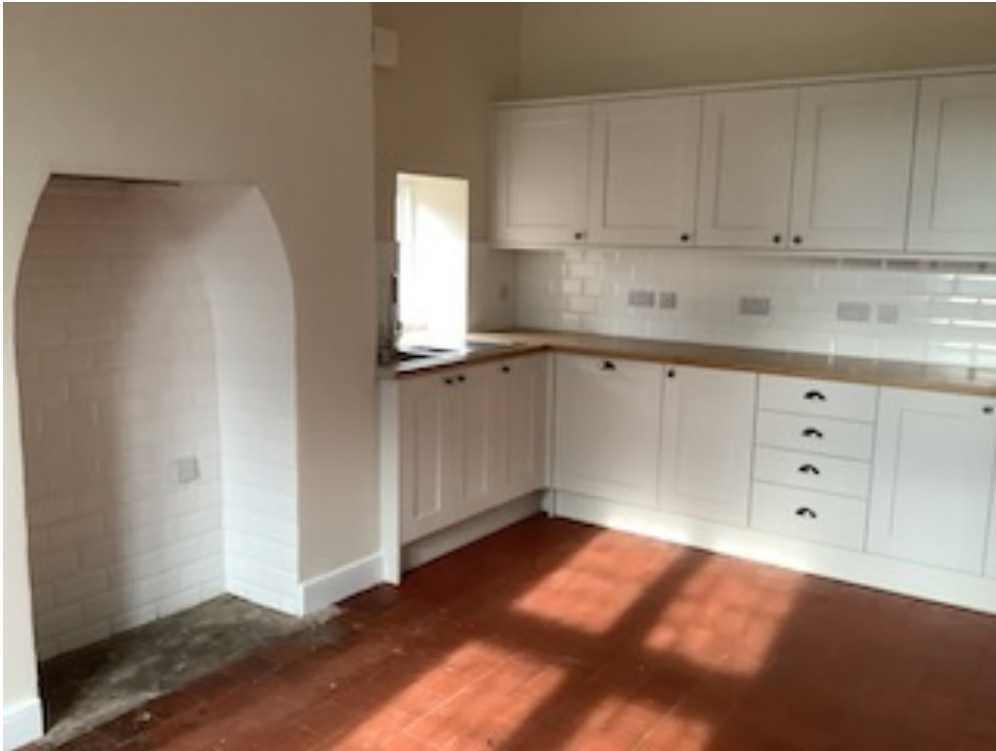
Figure 6 Kitchen Diner - 5450 x 4525mm