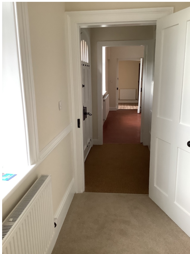
Figure 5 Hallway