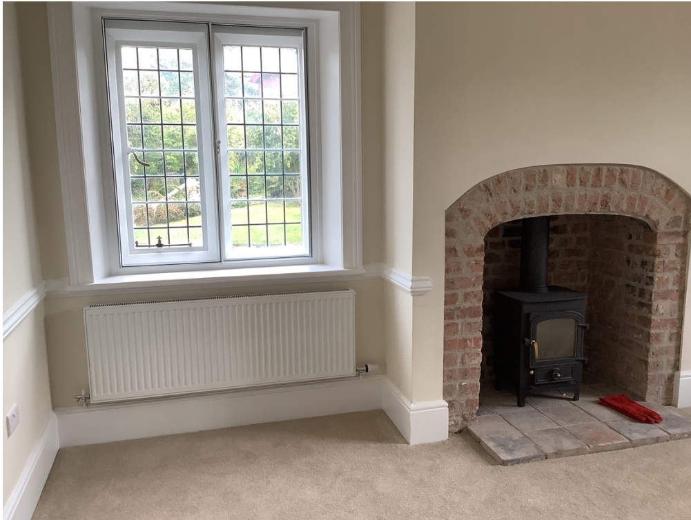
Figure 4 Lounge - 5450 x 4090mm