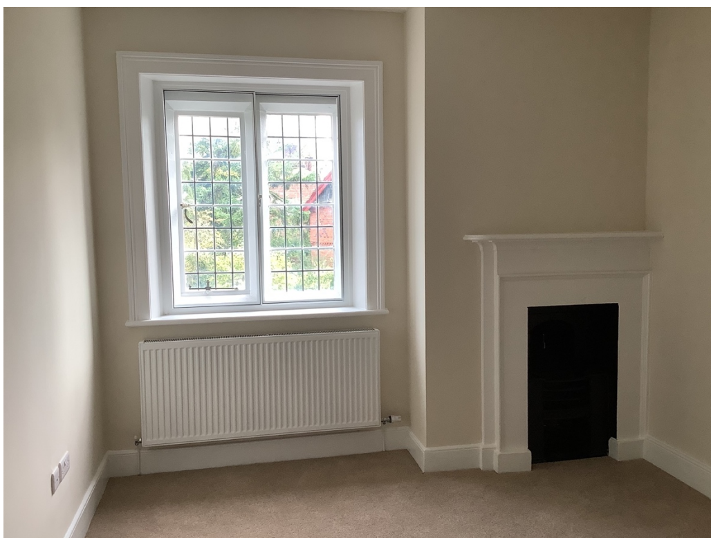
Figure 9 Bedroom 2 - 4090 x 3165mm