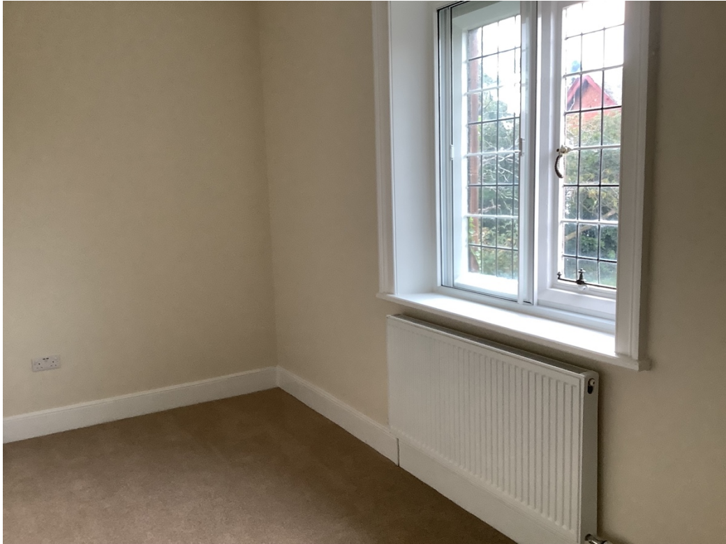
Figure 10 Bedroom 3 - 4525 x 2135mm