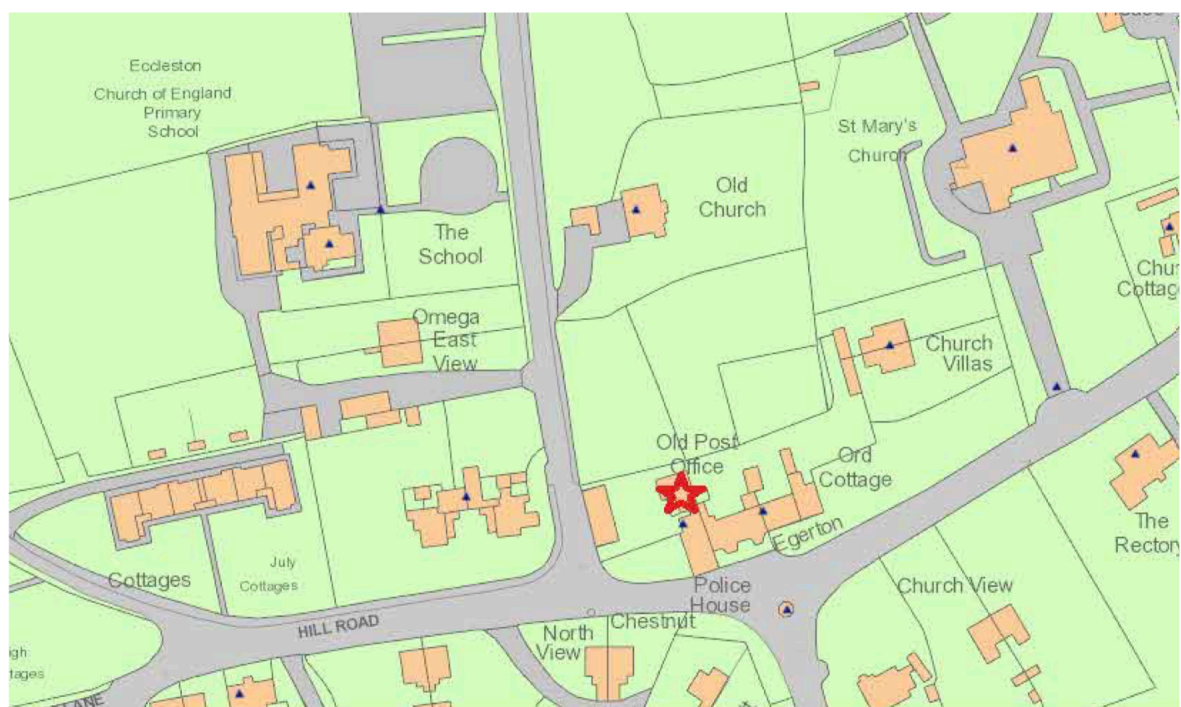
Figure 1 - location of police house within Eccleston