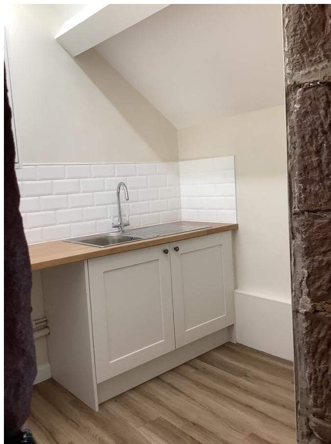
Figure 7 Utility Room