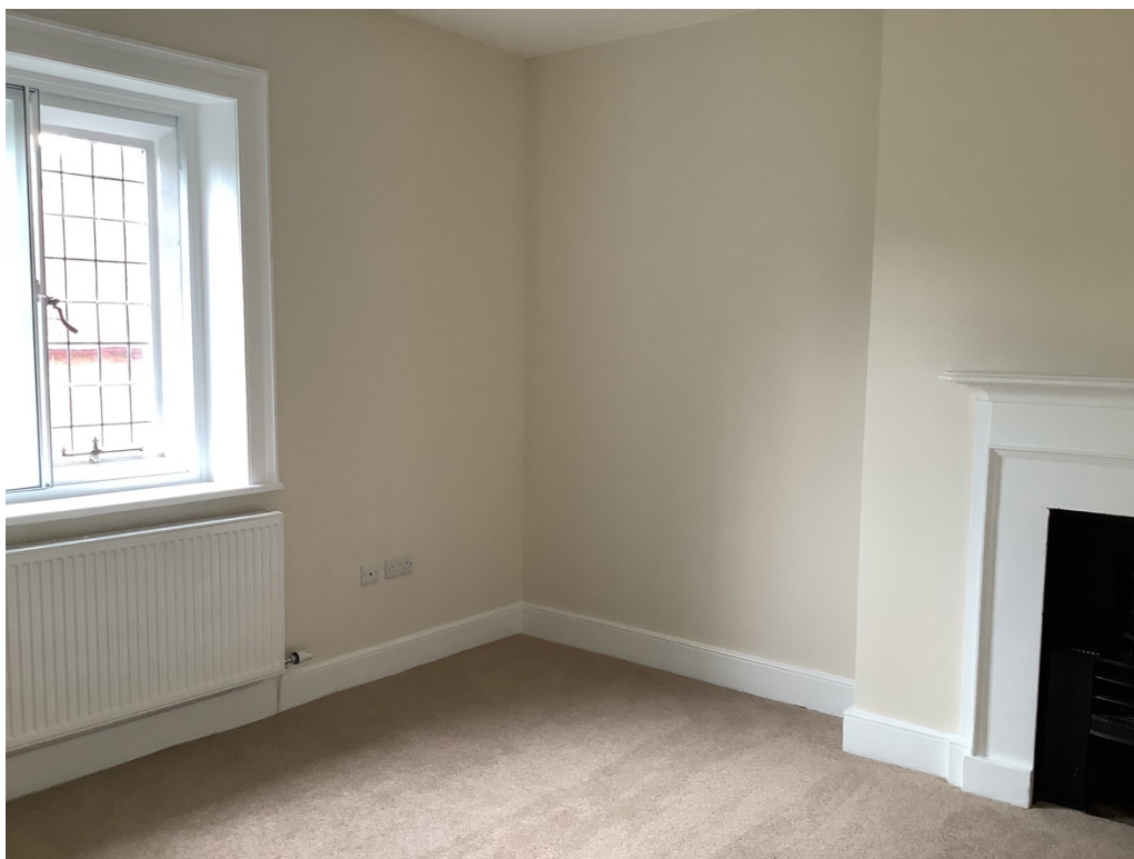
Figure 8 Bedroom 1 - 4525 x 3520mm