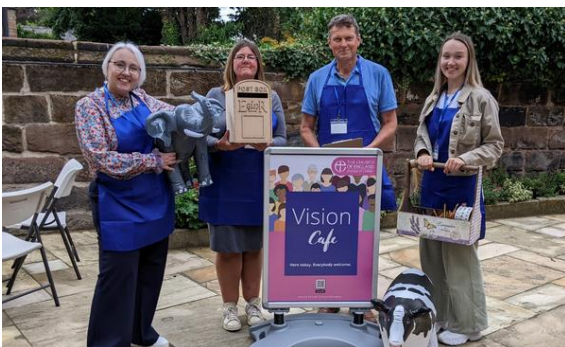
The first Vision Cafe event was held in Grappenhall in September

The grassroots consultation process, called Casting the Net Wide , began in the autumn of 2022. Since then, people of all backgrounds, ages, gender, and tradition have contributed their ideas and thoughts on how the Church can develop a new vision and strategy for the future.