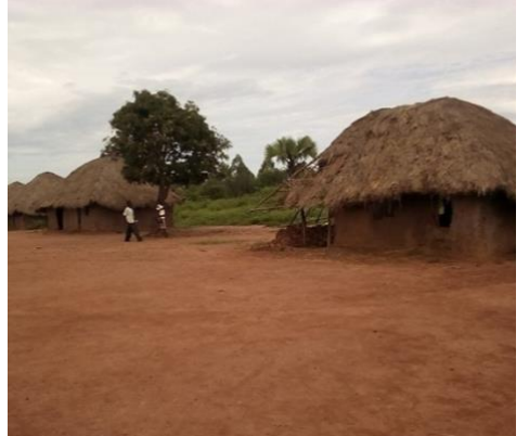
New building under construction

Pupils in old school with holes in the walls and roof prop.