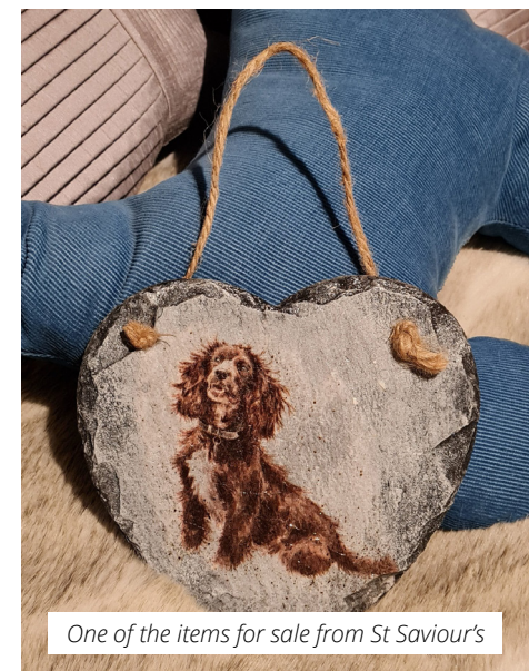
One of the items for sale from St Saviour's

The items can be viewed on St Saviour's Facebook page .