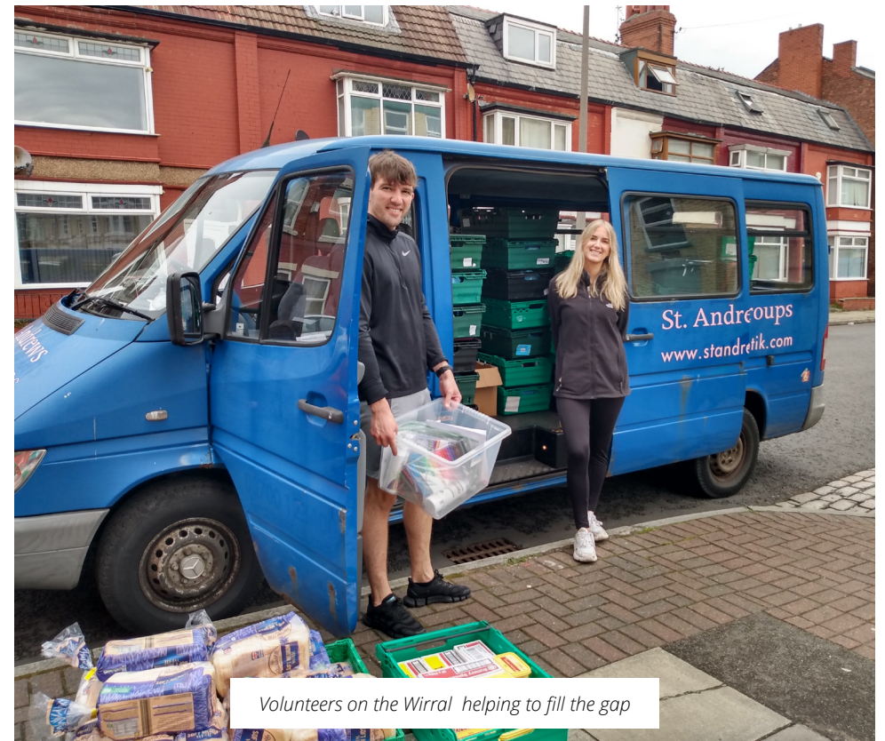
Volunteers on the Wirral helping to fill the gap