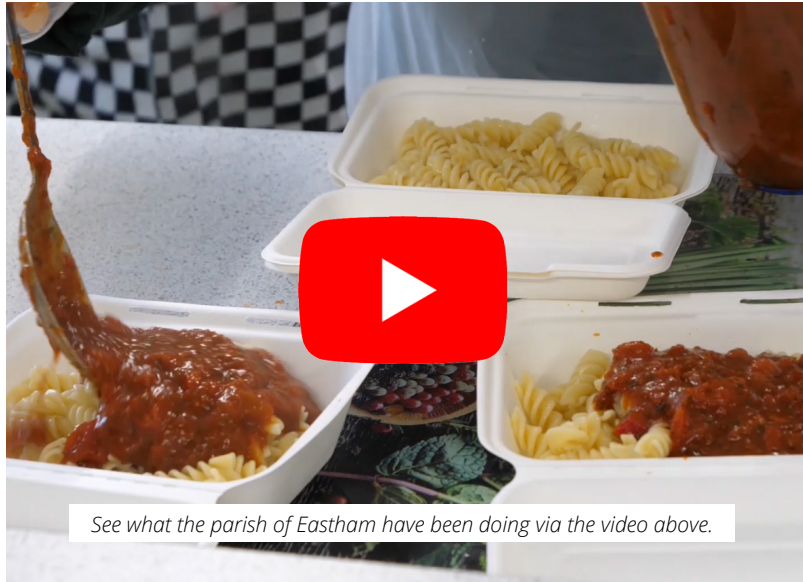
See what the parish of Eastham have been doing via the video above.

H igh up the news agenda in recent weeks has been the issue of food poverty and school holidays.