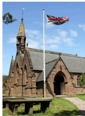
St. John the Evangelist in Alvanley