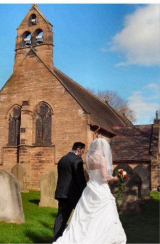
Christ Church Crowton