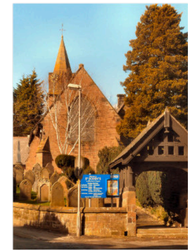
St John the Evangelist in Kingsley

Surrounded by gardens and owned by Norley PCC, the NCK Centre is a modern, light, accessible and flexible space with an office and a kitchen, used by church and other groups for meals and meetings, work, worship and play.