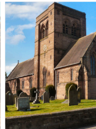
St John the Evangelist in Norley