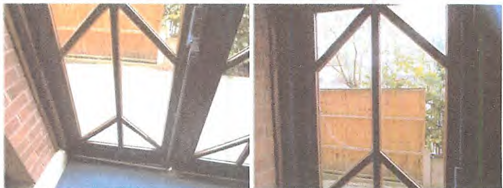
Damage to rear door