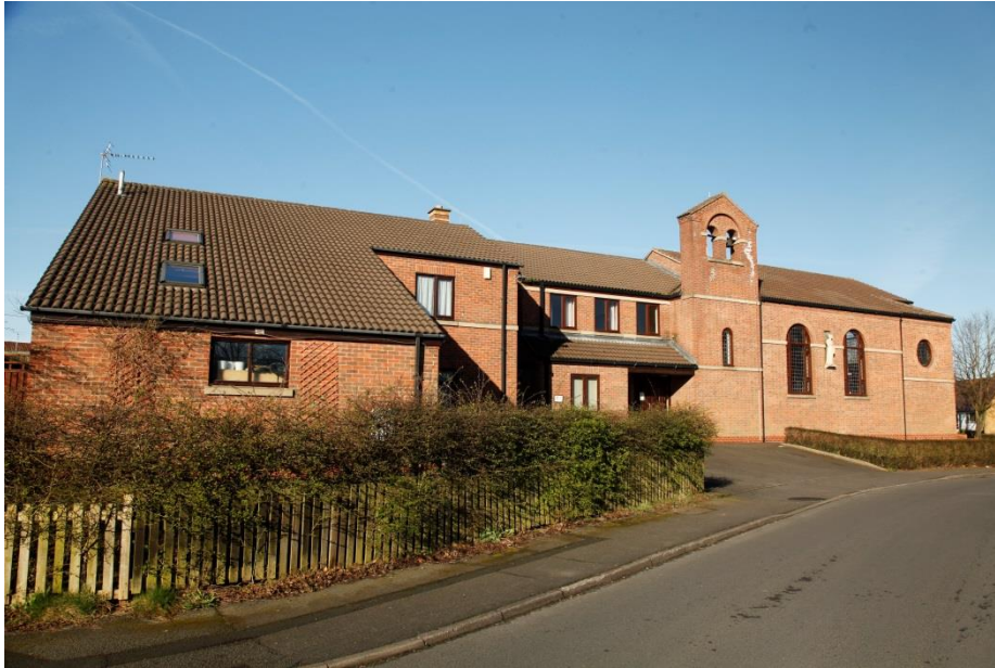
St John the Evangelist, Macclesfield (population c.9118)