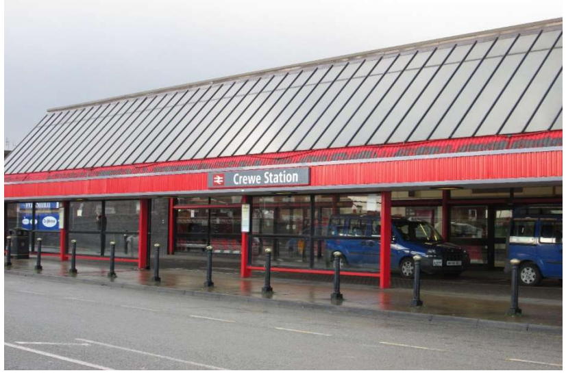
Crewe Railway Station

Most of Crewe railway station is contained within its boundaries, as is Crewe Alexandra's football stadium. The population of St Andrew's and St John's Parish is circa 13,000.