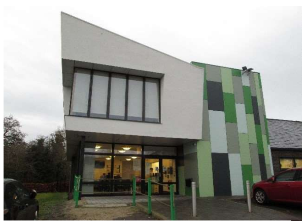
Gresty Brook Surgery

https://www.cheshireeast.gov.uk/council_and_democracy/council_inform_ation/cheshire_east_area_profiles/ward-profiles/ward-profiles.aspx