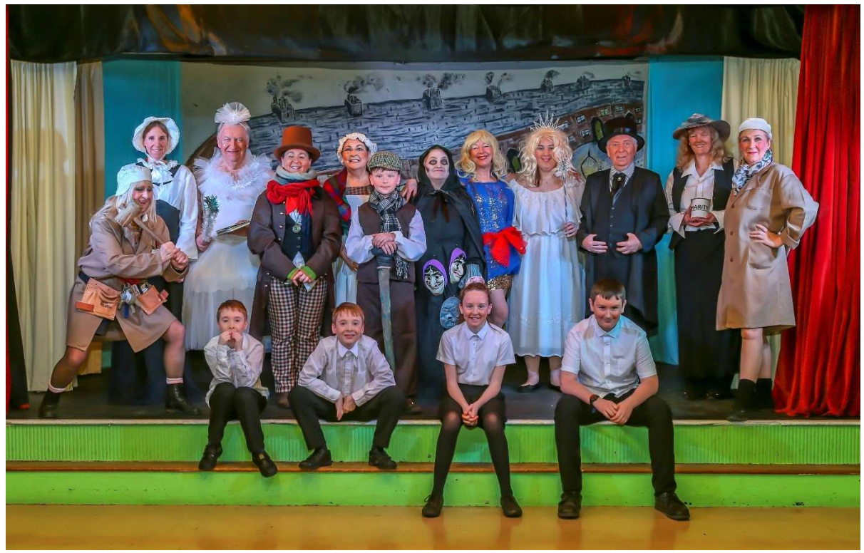
TAPPS 2019 Pantomime - 'A Christmas Carol

Each January The Andrews Panto and Play Society (TAPPS) performs a pantomime with full houses of approximately 80 for each of the four performances. A annual variety show and play reading evenings are also