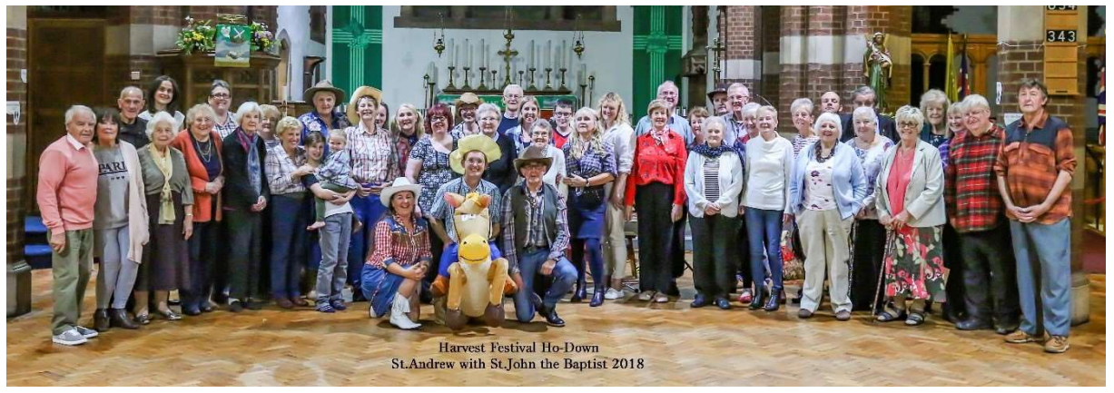
Harvest Hoe Down

Our parishioners enjoy many social activities as members of the organisations affiliated to the church. Tea dances, hoe-downs and a Summer and Christmas Fair are held during the year. There are also occasional concerts featuring local choirs and orchestras and an annual pantomime.