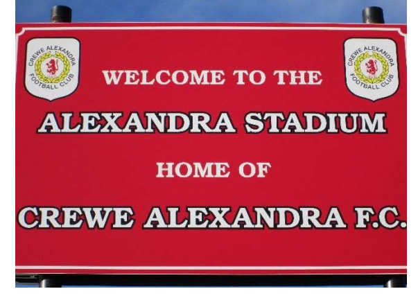
Crewe Alexandra Football Stadium

The busy A534 Nantwich Road, approximately a mile away from the town centre, goes through the middle of the Parish and is a bustling shopping and leisure area. This was the original boundary between the Parish of St. Andrew and the Parish of St. John the Baptist.