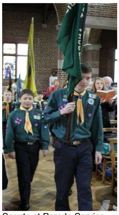
Scouts at Parade Service