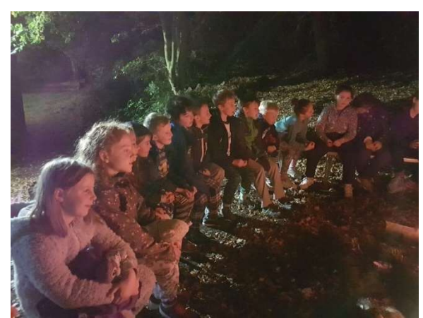
Round The Camp Fire