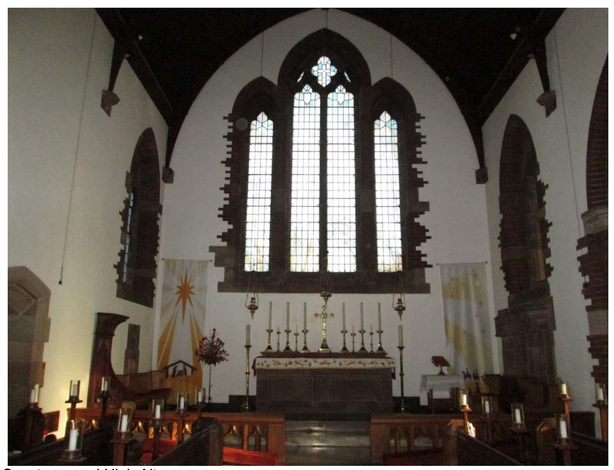
Sanctuary and High Altar

The construction of St Andrews Church building was commenced in 1932 but had not been completed by the time of World War 2. A temporary wooden gable end was then constructed at the western end of the partially completed church building. Work was recommenced in 1959 to complete the building and this was finally finished in 1965.