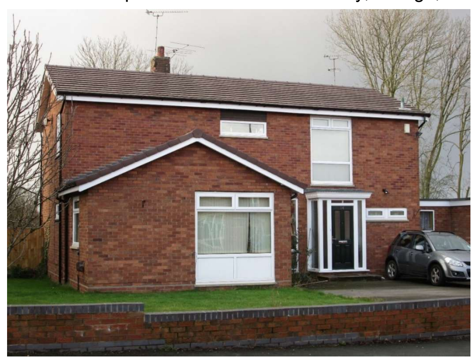
St. Andrew with St. John the Baptist Vicarage

The detached 1960's brick built vicarage is within walking distance of the church. It comprises two floors with study, lounge, dining room, large