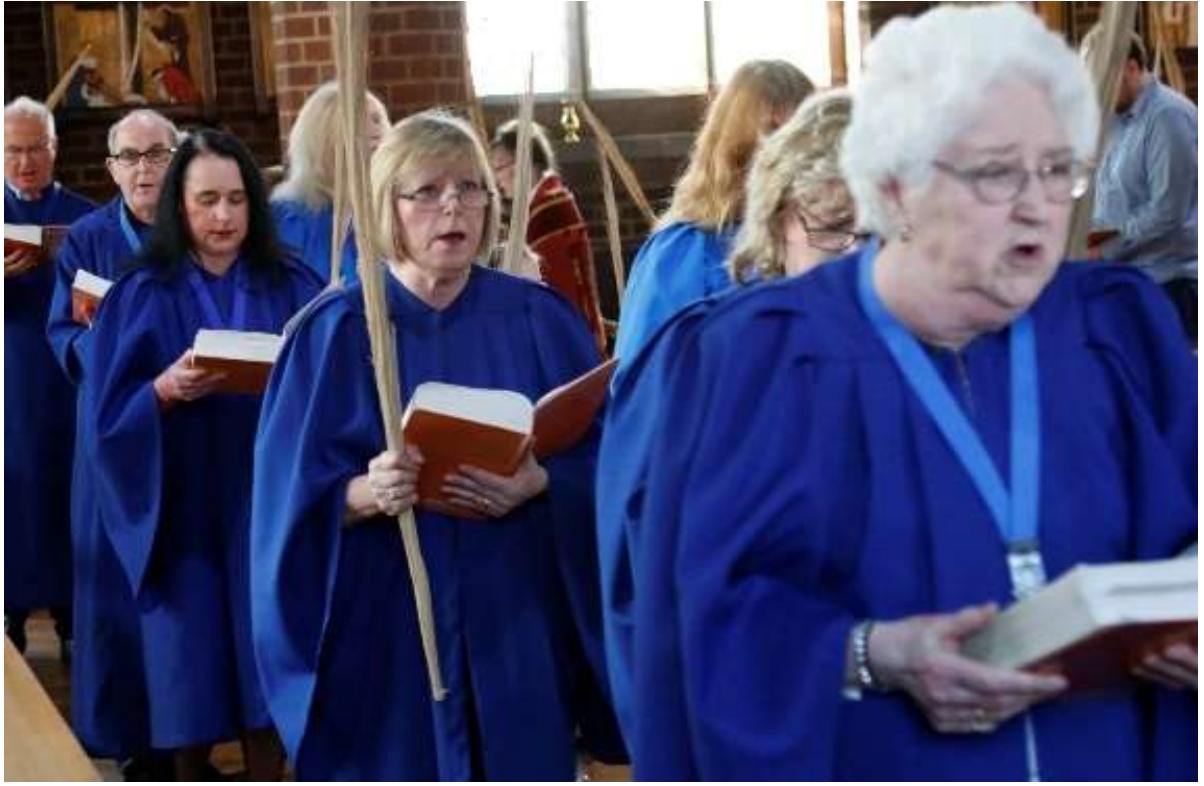
Palm Sunday Procession

Our choir is augmented by other local choirs for special services at Christmas and Easter and for occasional concerts. The church has a modern Wyvern 3 manual electric organ.