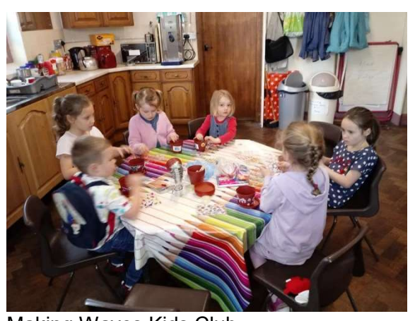
Making Waves Kids Club

There is a very active children's ministry team at St Andrew's, with Making Waves Kids' Club which meets during the main 9:30 service on Sundays. On the first Sunday "Breaking Bread" service the children are present for the whole service, whereas on the other Sundays they move to the vestry following the start of the service where they have their