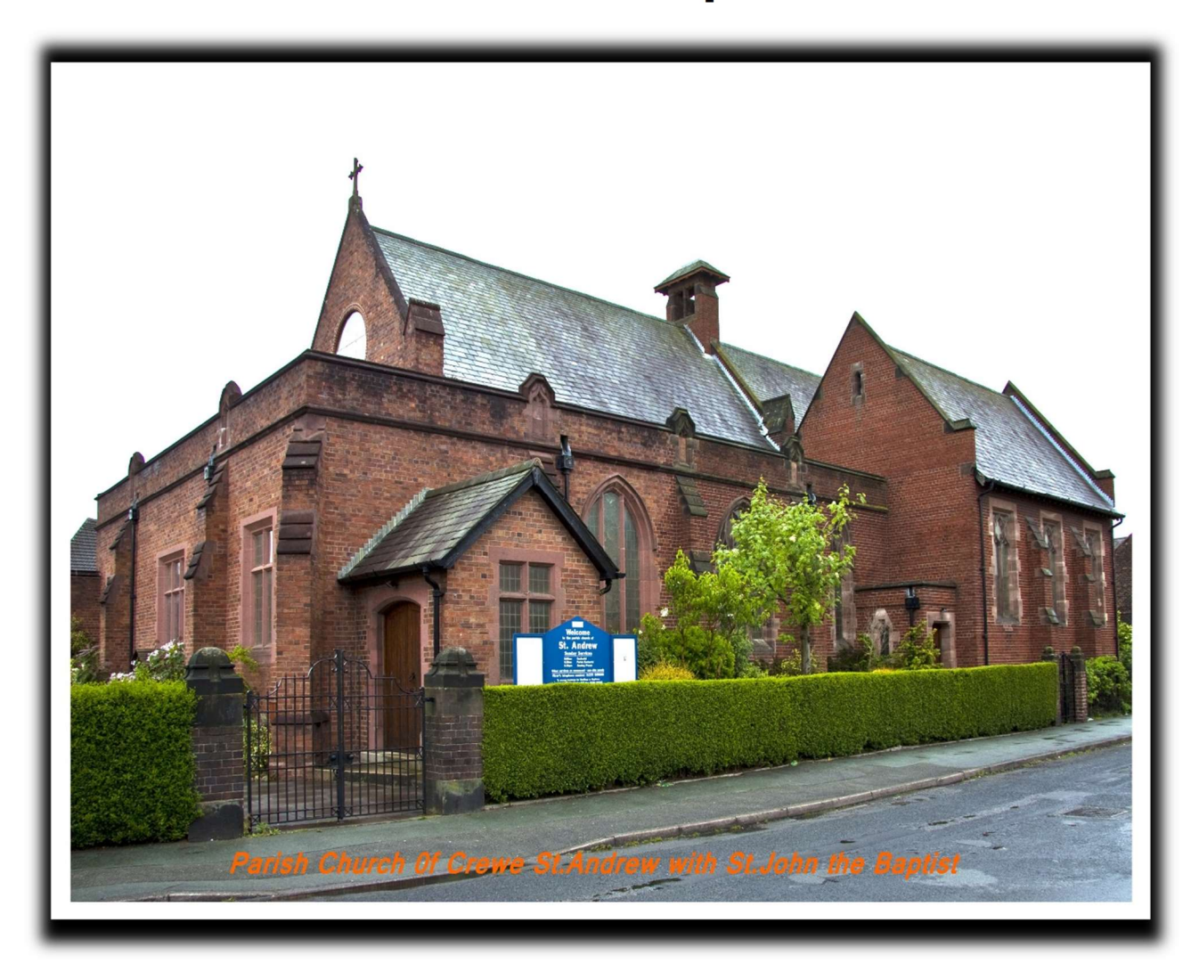
"St. Andrew's has a family feeling; it's my family"