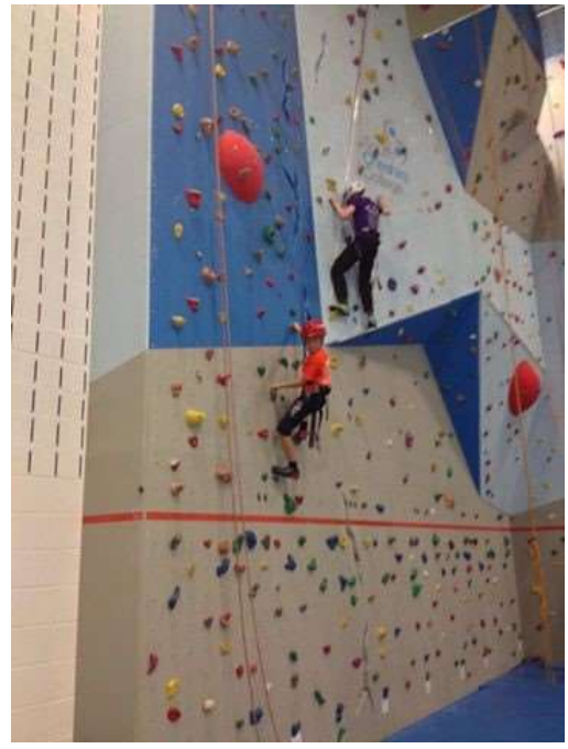
Scouts on South Cheshire College's climbing wall

Scouts meet on a Friday night but there are also many other 'meetings' throughout the year on activities which include camping, climbing, canoeing/kayaking, hiking, abseiling, shooting, to name but a few.