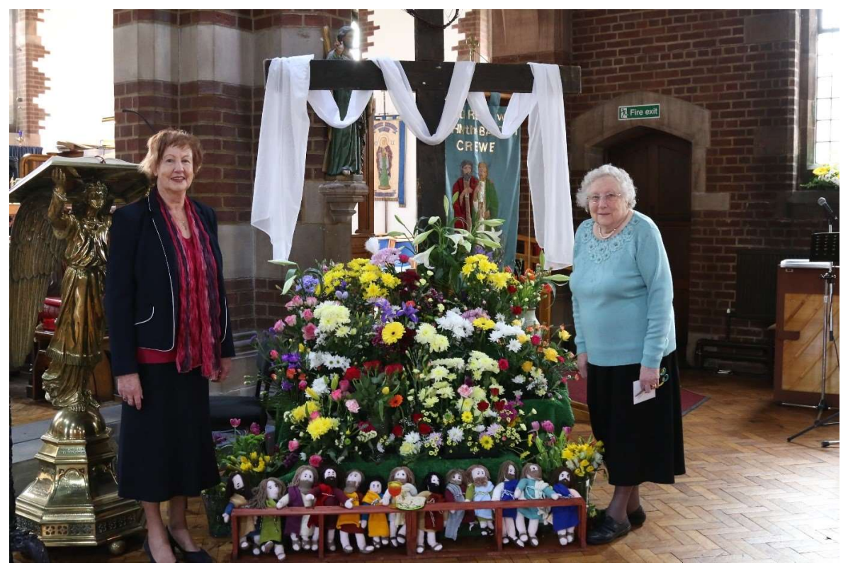
Easter Sunday Flowers

Currently, St Andrew's has 119 on the electoral roll (2019), 77 of whom live within the parish.