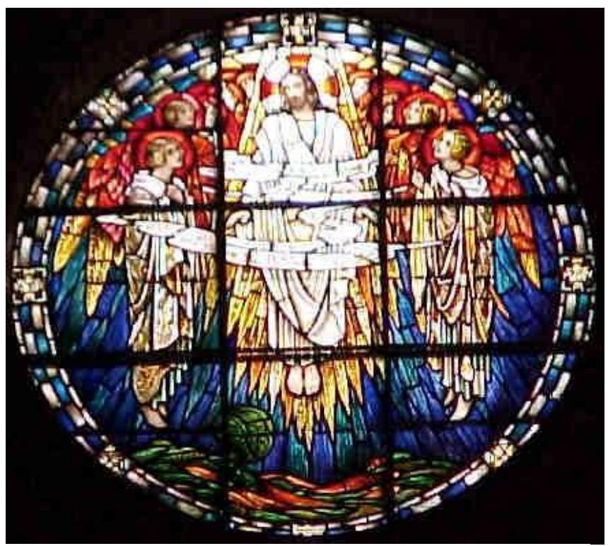
Rose Window depicting the Ascension