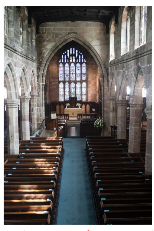
The Parish Magazine of St Mary Sandbach