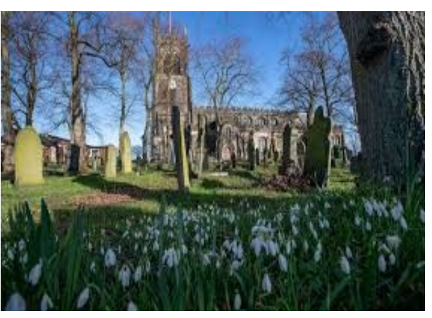
Parish Profile 2019