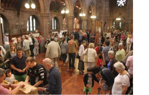
The Summer Fair