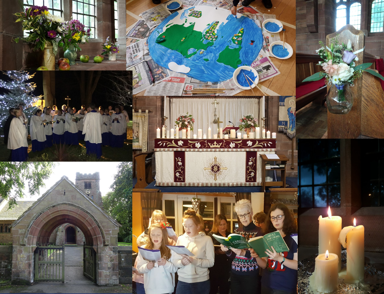
St John's Church, Sandiway