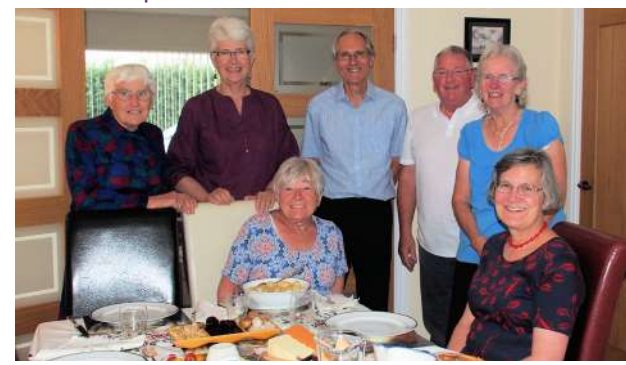
The Mission Committee enjoy a meal with two of our partners