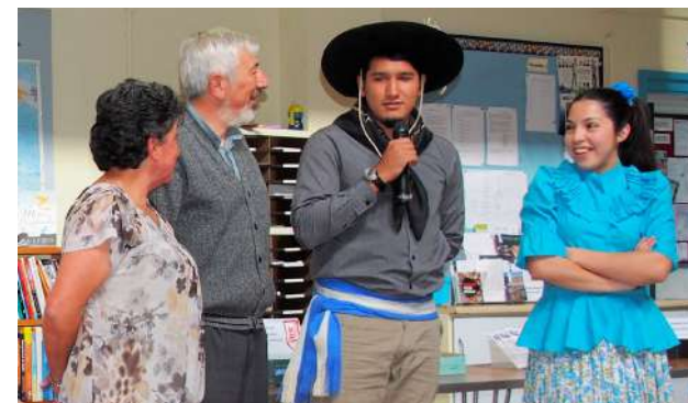
Our mission partners from South America

As well as all specific mission giving, a minimum of 10% of the total general fund giving is also distributed through the Mission Committee.