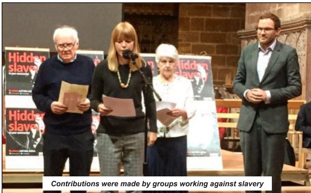
Contributions were made by groups working against slavery