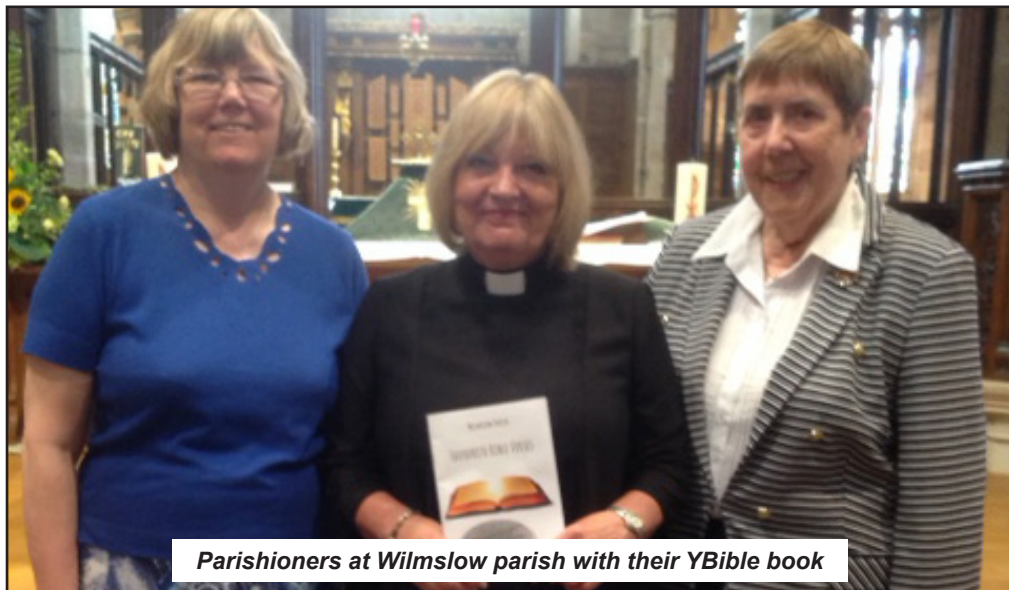
Parishioners at Wilmslow parish with their YBible book

Wilmslow Parish Church asked its congregation members to nominate their favourite bible verse and published a special book as part of the YBible initiative. The nominations have been accompanied by images and personal stories.