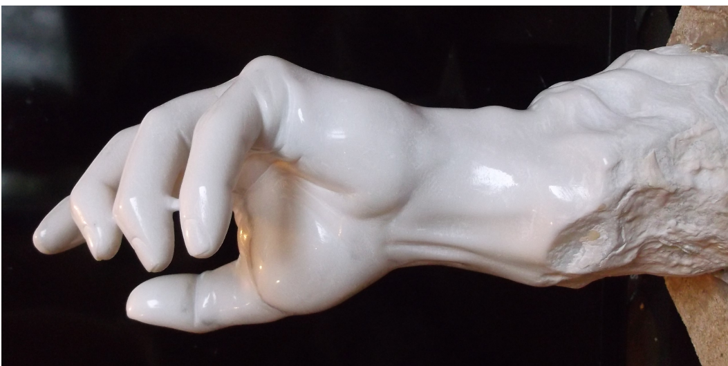
Example of stone sculptor's work