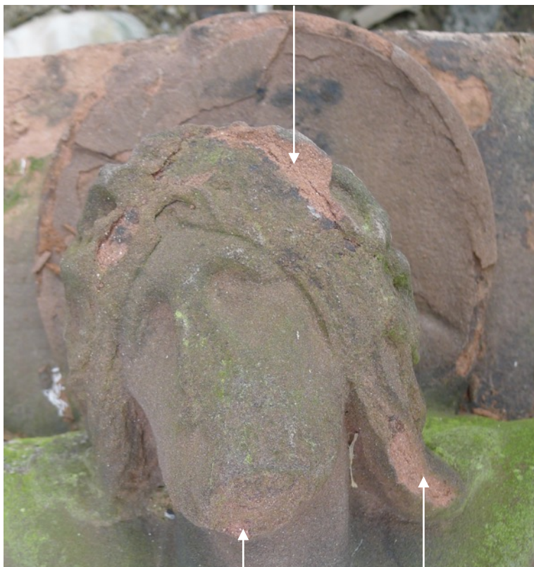
Further loss of detail_ September 2018