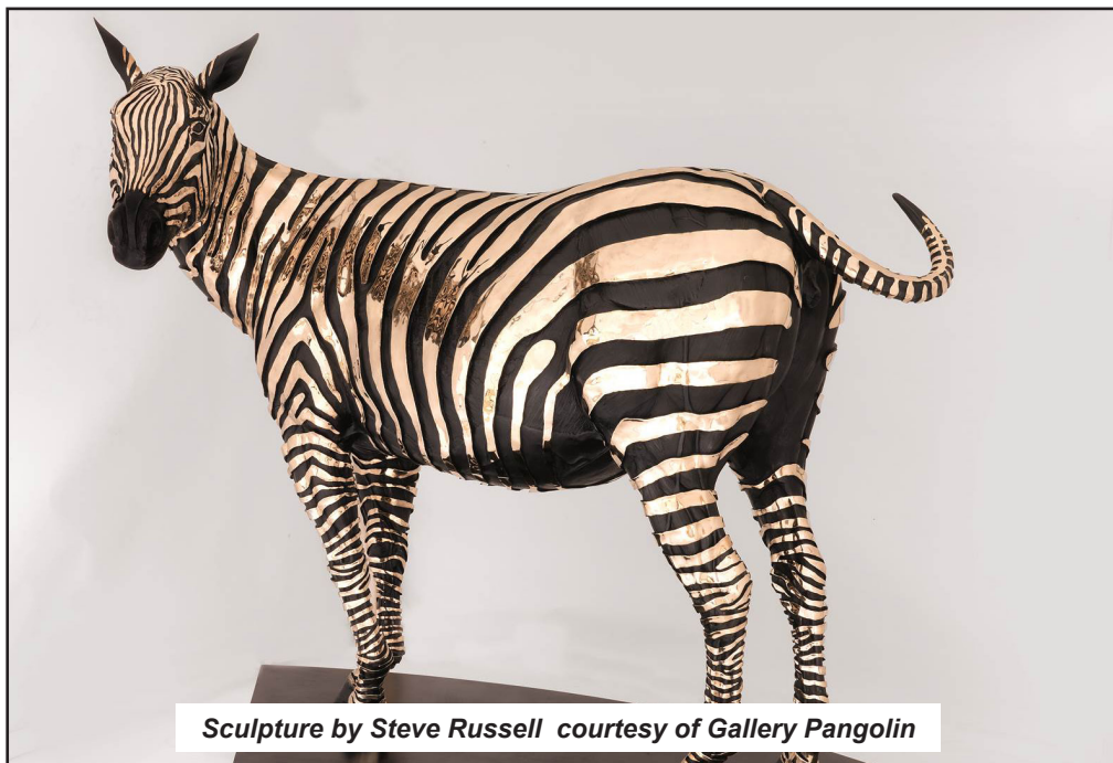
Sculpture by Steve Russell

ARK is a contemporary sculpture exhibition of international importance and will take up residence at Chester Cathedral between 7 July and 15 October 2017.